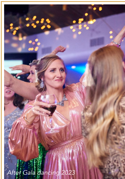
After Gala dancing 2023